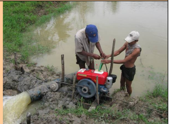
Figure 4: CARE is working together with the community members to clean out their water ponds