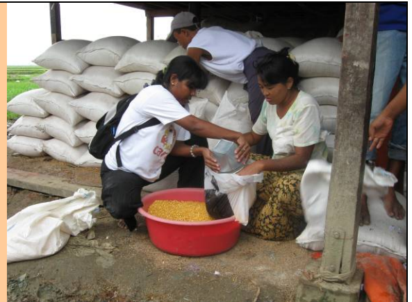
Figure 6: CARE is distributing the food to affected households