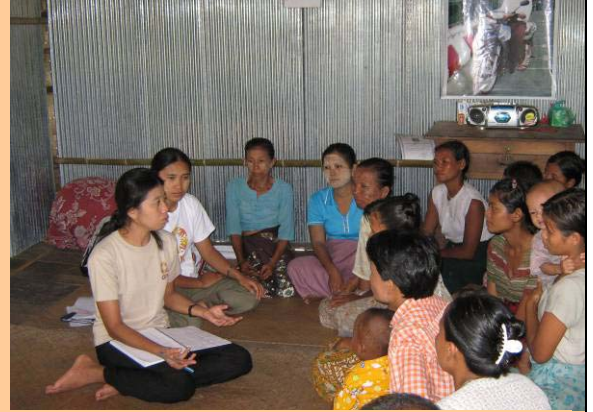
Figure 3: Women group discussion to identify the specific needs of women