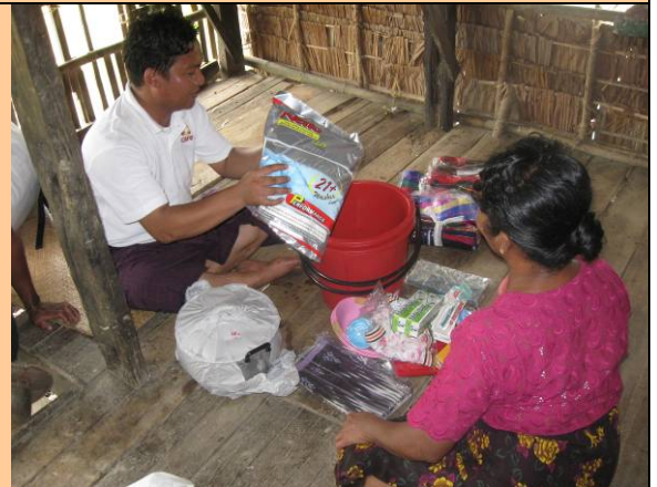
Figure 7: CARE staff member is counseling the woman who received the family kit from CARE to effectively use the mosquito net which included in the family kit.

Health interventions will target the most vulnerable, including people living with HIV and AIDS, people with TB, and pregnant and lactating women. CARE will coordinate with and work in partnership with health focused NGOs such as MSF, AZG and MRCS. This health support programme will be implemented if permission from the Department of Health secured.