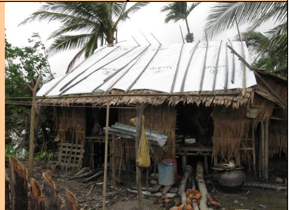
Figure 5: CARE is helping the affected households rebuild their home & community, & distributing more than 100,000 pieces of bamboo and 3829 (4m x 6m) pieces of plastic sheeting