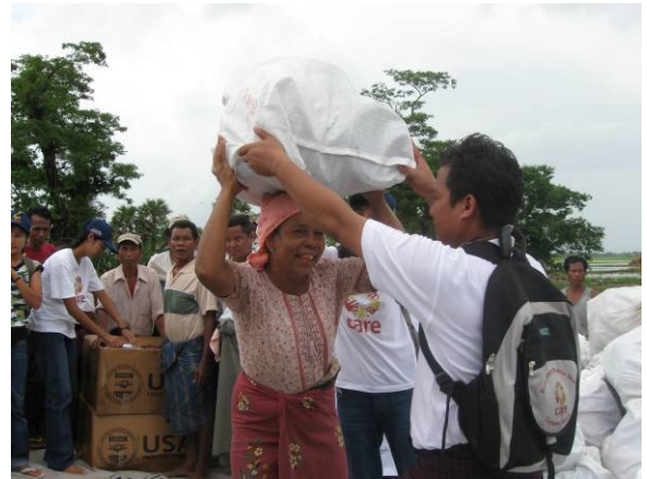
Figure 8: Working with the community