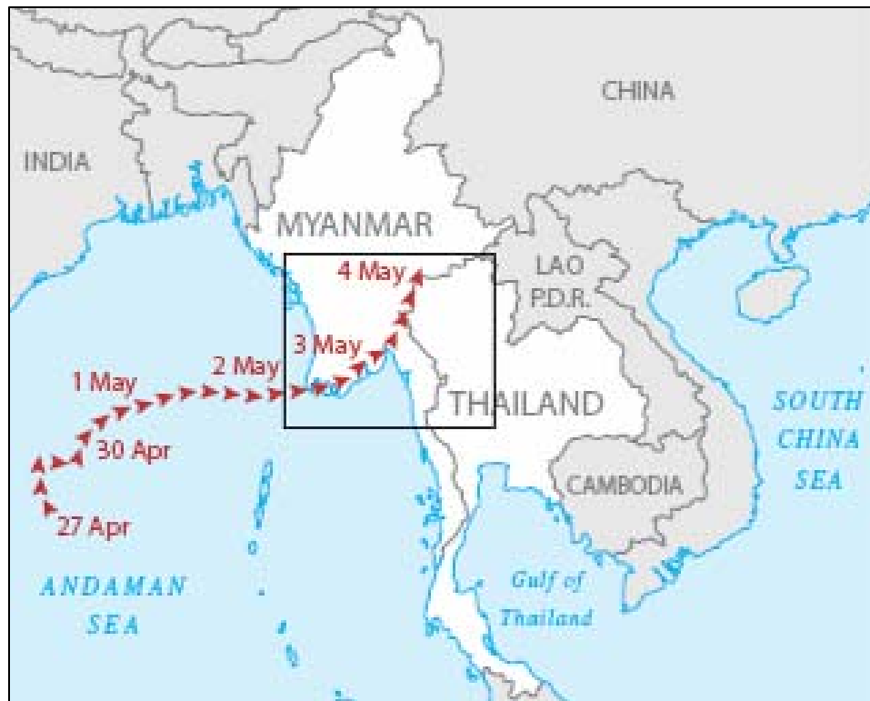
Figure 1: The path of Cyclone Nargis over Myanmar

On the 2 nd of May 2008 Cyclone Nargis struck Myanmar. With a total population of 53 million, the two most severely affected areas were Ayeyarwady Division and Yangon Division with respective populations of 24 and 6 million people.