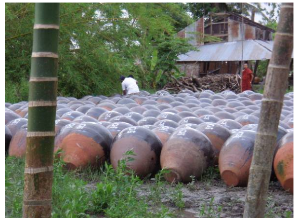
Figure 9: CARE is providing glazed earthen jars to the community in Ayeyarwady to store water