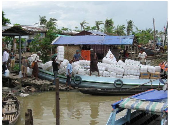
Figure 10: CARE staffs are using the traditional wooden longboats to transfer supplies to the affected households in Ayeyarwaddy delta

One of CARE’s biggest challenges is transporting aid down through the maze of waterways that make up the Ayeyarwady Delta. Many areas where CARE is working are reachable only by boat, and the rivers are filled with downed trees and sunken fishing boats. CARE’s national staff and their knowledge of these areas is crucial to these missions.